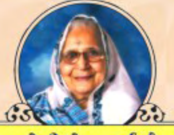
मातोश्री प्रेमाबाई जैन उच्च शिक्षण शिष्यवृत्ती योजना

Suresh Dada Scheme for Educational & Entrepreneurial Development सुरेशदादा शैक्षणिक व उद्योजक विकास योजना