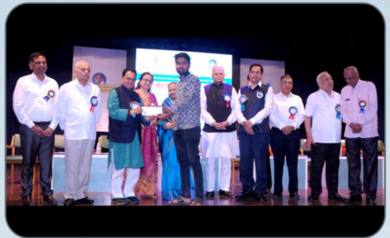
Chief Guests, Dignitaries & Beneficiaries