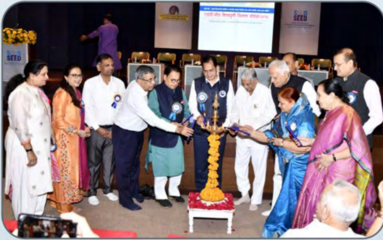
Lighting the Lamp, Chief Guests Speech, Dignitaries, Students & Parents