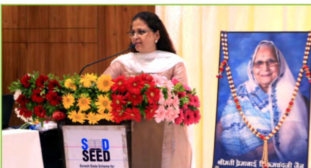
Vote of Thanks