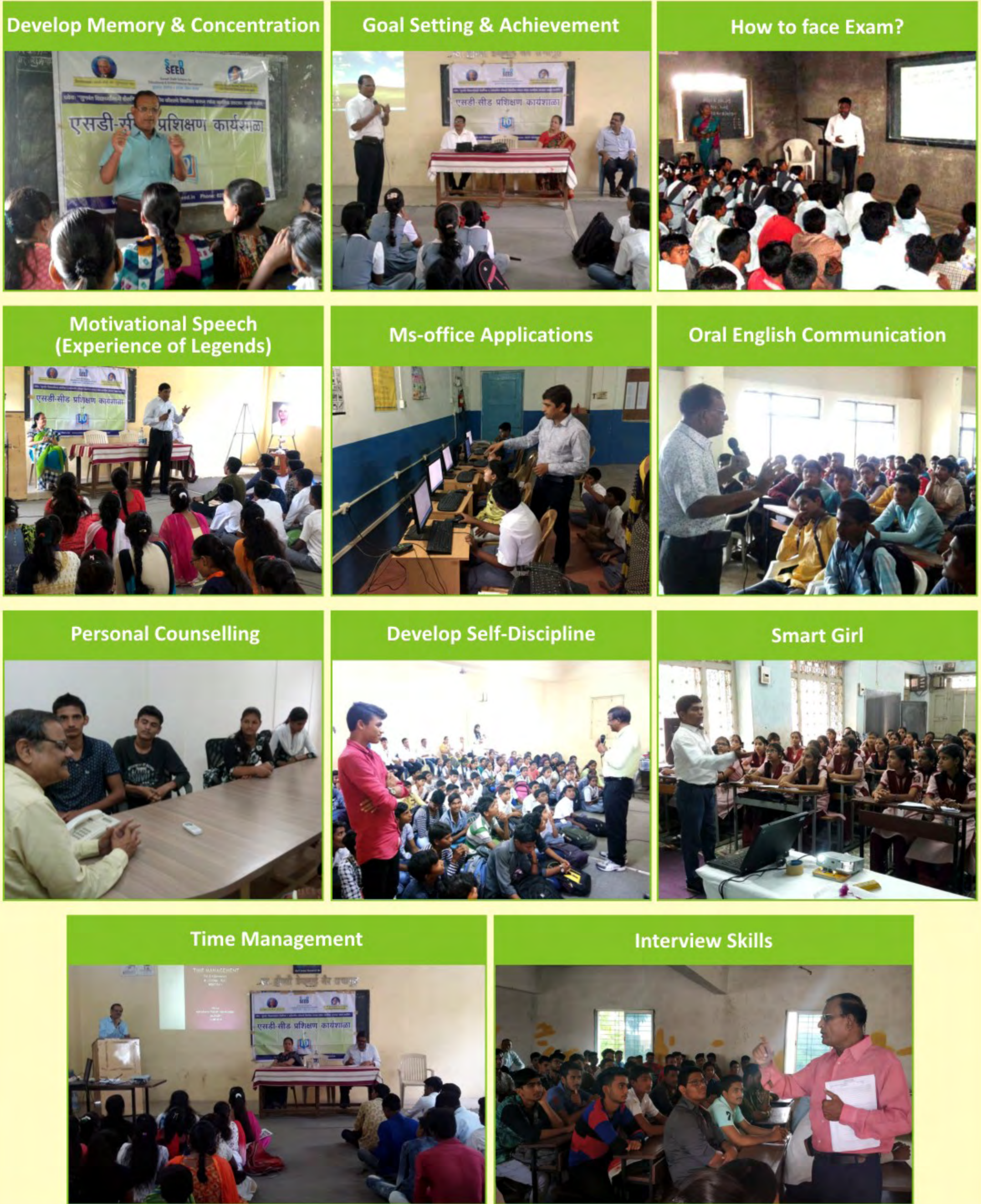
Develop Memory & Concentration

SD-SEED has been imparting training in soft skills and personality development to all students. These programs help them to focus on developing their soft skills, thereby improve in their study habits, become confident, thus creating a successful and empowered society. In the last four months, 23 programs were conducted on 13 topics which benefitted 2200 students.