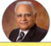
प्रेरणास्थान: माजी मंत्री श्री. सुरेशदादा जैन