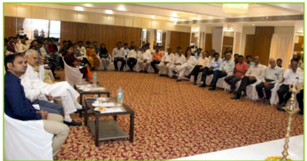
Dignitaries &amp; Alumni