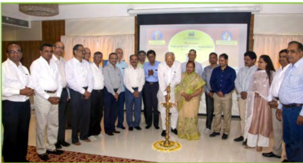
Lighting the Lamp