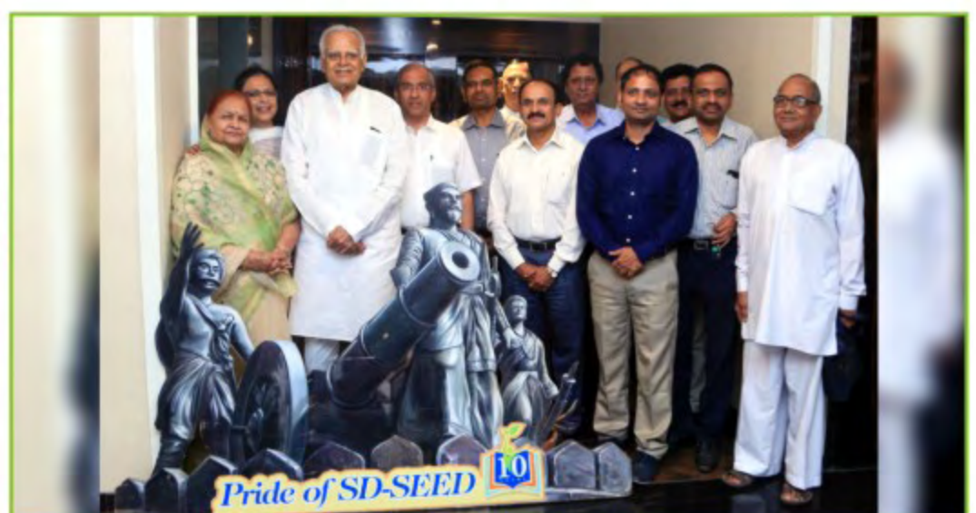
Dignitaries &amp; Members