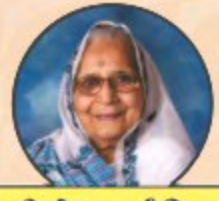
मातोश्री श्रीमती पेमाबाई भिकमचंदजी जैन उच्च शिक्षण शिष्यवृत्ती योजना

Suresh Dada Scheme for Educational & Entrepreneurial Development सुरेशदादा शैक्षणिक व उद्योजक विकास योजना