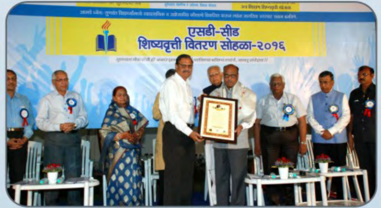
Dignitaries, Students and Parents present