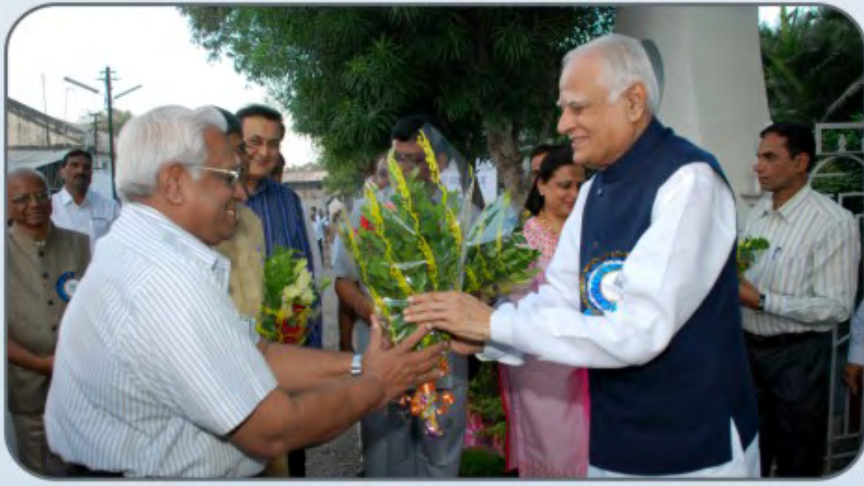
Welcoming the Chief Guest, Lighting the lamp and presentation of citation